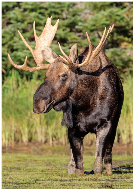
Moose abound in the Rockies.

Day 10: Banff Our last full day in the Canadian Rockies begins with a ride aboard the Banff Gondola to the top of Sulphur Mountain, so named for the hot springs on its lower flank. This 8,000-foot peak overlooking the town of Banff affords stunning mountain views in every direction; indeed, we can see six mountain ranges during this excursion. Then we travel Tunnel Mountain Road to visit two more natural wonders: the Hoodoos, a collection of eroded