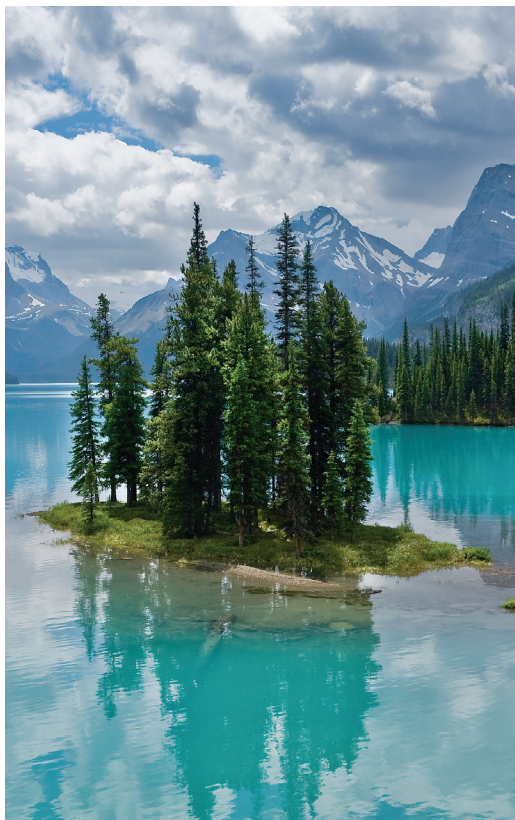
Spirit Island sits in stunning Maligne Lake.

limestone spires strung along a wooded hillside; and Bow Falls, a wide waterfall just outside Banff. The afternoon is free to explore Banff before we celebrate our outdoor adventures with a farewell dinner at our hotel. B,D