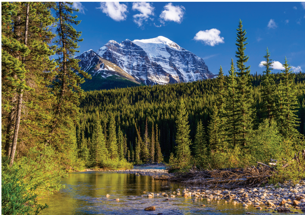
Five national parks sit within the Canadian Rockies.

a winding mountain pass that offers breathtaking views and hair-raising turns. After time for lunch on our own we meet up with our motorcoach and continue southwest across the Continental Divide. After arriving late this afternoon in the resort town of Whitefish, Montana, we dine together tonight. B,D