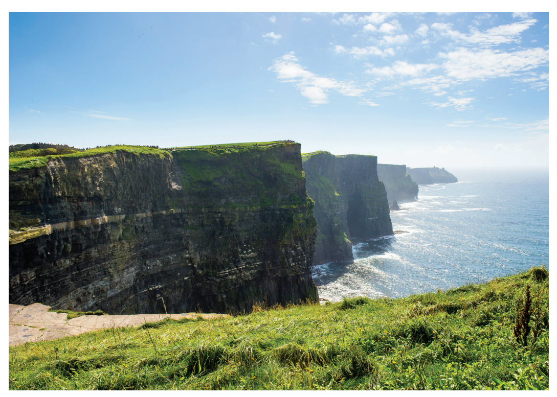
The sun shines down on the Cliffs of Moher, as we see on Day 7.

here, imparting local lore along the way. We stop at Dun Aenghus Fortress, the three prehistoric stone walls crowning the tallest cliffs of Inishmore; have lunch in a local pub; and enjoy some free time before returning to the mainland and our hotel late this afternoon. Dinner tonight is at a local restaurant in the village of Bearna. B,L,D