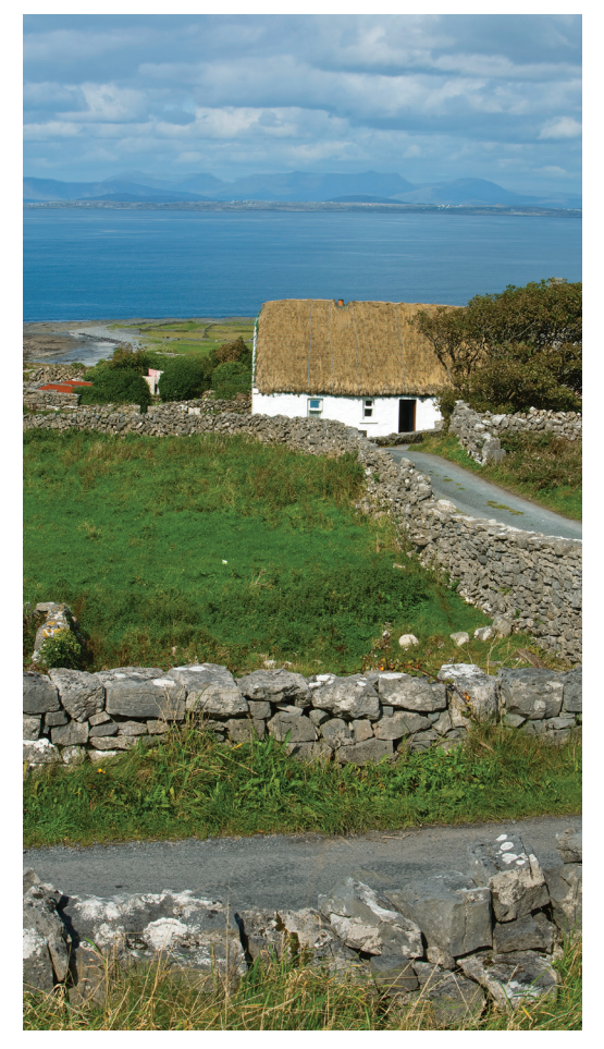
We spend Day 6 on the Aran Islands' Inishmore.