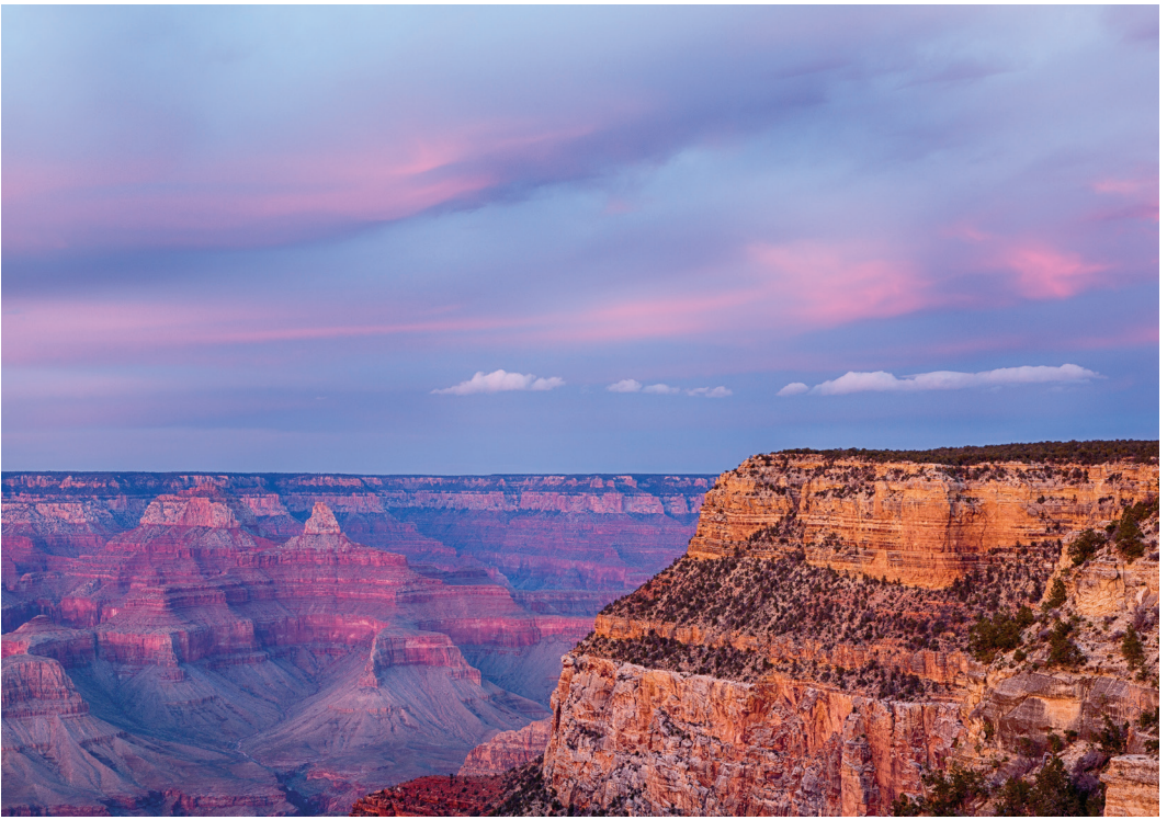
The magnificent Grand Canyon

the mighty Colorado River rushes one mile below. On our guided tour, we learn about the canyon's geological history, and also about human history here: it dates back some 10,000 years and includes Native peoples, explorers, miners, entrepreneurs, conservationists, and of course, visitors – who today number some six million annually. Then we have time for lunch on our own and an afternoon at leisure to appreciate the magnitude and beauty of the six-million-year-old canyon as we wish. After this bucket-list day, dinner tonight is on our own. B