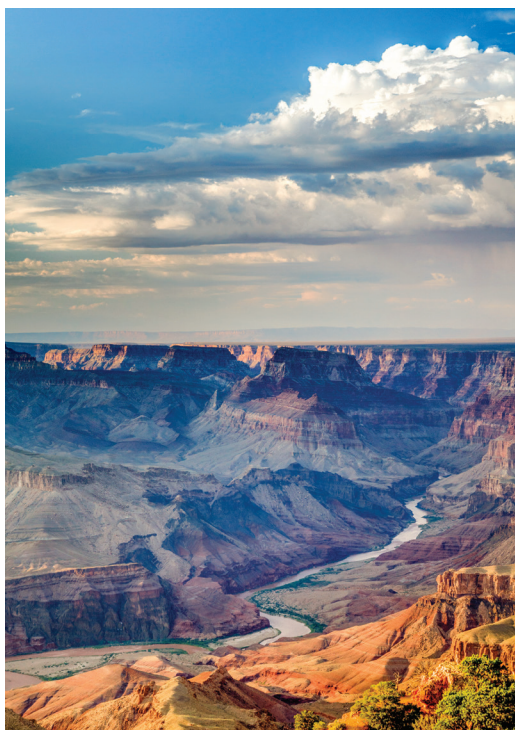
The Colorado and the Grand Canyon

En route to Las Vegas today, we stop in St. George, Utah, site of the winter home of Mormon leader Brigham Young and where the Mojave Desert, Colorado Plateau, and Great Basin converge in a stunning