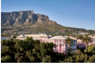
Belmond Mount Nelson Hotel | Cape Town