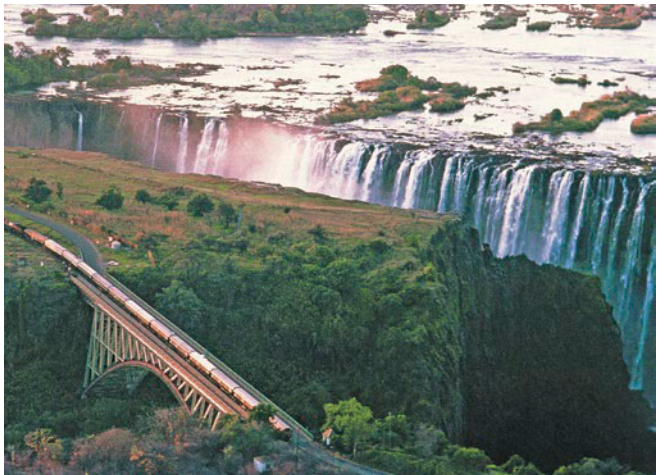
Rovos Rail, Victoria Falls