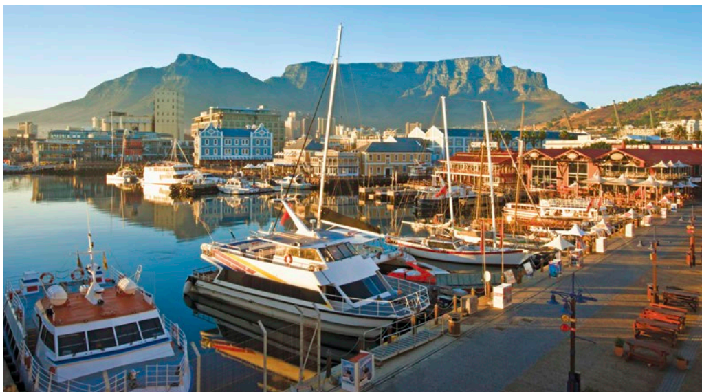
Victoria &amp; Alfred Waterfront, Cape Town