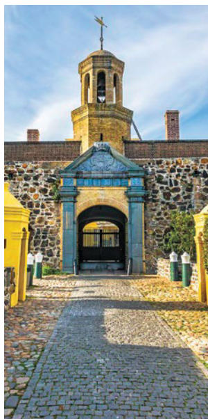
Castle of Good Hope, Cape Town

Knowledgeable Lecturers deepen your appreciation for the region and its history, culture and current events.