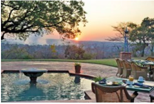
The Victoria Falls Hotel | Victoria Falls