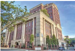
54 on Bath | Johannesburg