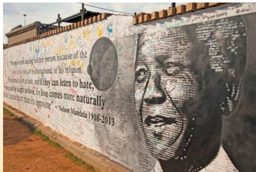
Nelson Mandela mural, Soweto