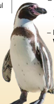
African penguin, Boulder Beach Cape Peninsula