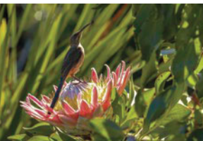
King protea, Cape Floral Region