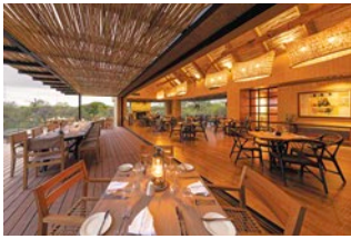
Kapama River Lodge | Kapama Private Game Reserve