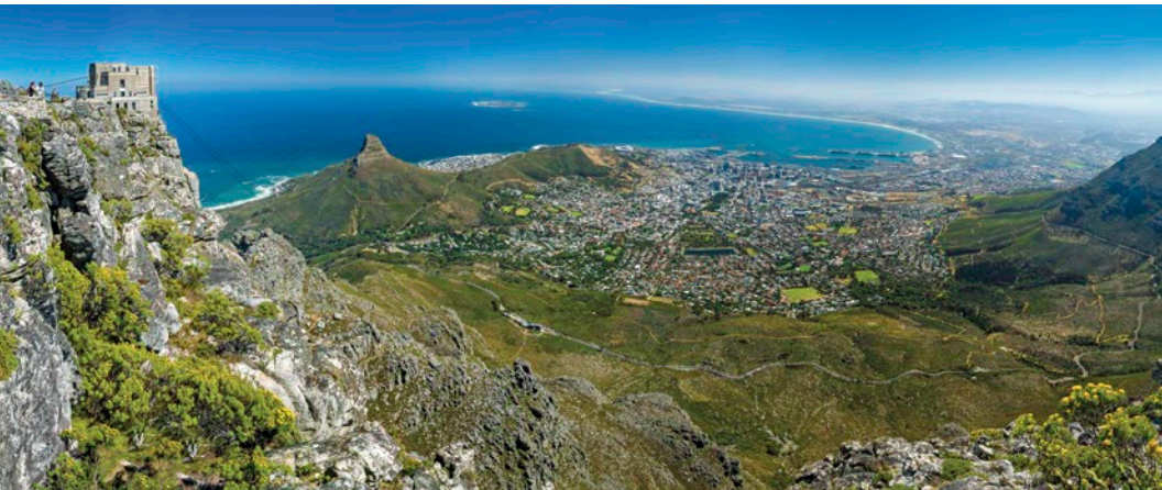
Table Mountain overlooking Cape Town

treetops, the open veld where zebra graze and much more. Feel free to ask your guides questions about the animals. They are eager to share their passion with you!