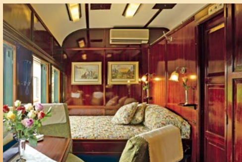
Deluxe Suite with a double bed and a lounge area

Discover the glamorous Golden Age of train travel aboard the luxurious Rovos Rail. Revel in the incredible attention to detail and lavish offerings while riding in vintage carriages, restored to mint condition and impeccably appointed. Spend your days in the Observation Car or mingle with your fellow travelers in the lounge. On-board chefs prepare traditional dishes and regional specialties with only the finest of ingredients. Enjoy sumptuous breakfasts each morning and delicious three-course lunches and dinners, featuring fine South African wines.