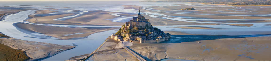
Aerial view of Mont-Saint-Michel