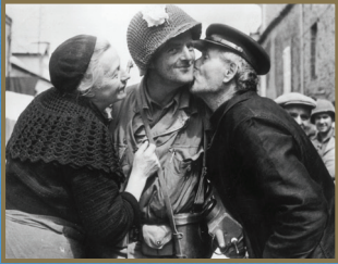
An American soldier is given a warm welcome after the town of Saint-Sauveur-le-Vicomte was liberated.

Hear their stories. Learn their names. Stand where history was made.