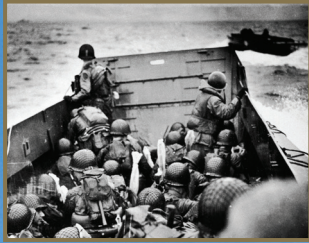
D-Day Landings on Omaha Beach