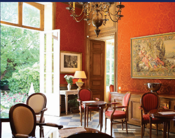
HÔTEL D'ARGOUGES Bayeux, France

The ideal location of the historic Hôtel d'Argouges is perfect for exploring Normandy. This elegant, 18th-century residence owned by the same family for two generations invites you to experience luxury and comfort among refined surroundings: high ceilings, original doors, period fireplaces, and parquet floors polished by time.