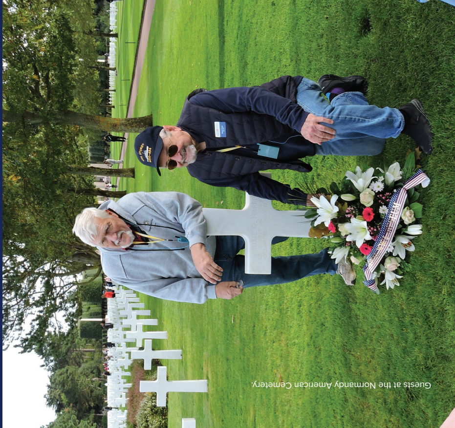
Guests at the Normandy American Cemetery.

Call 1-877-813-3329 X 257 • Email: travel@nationalww2museum.org