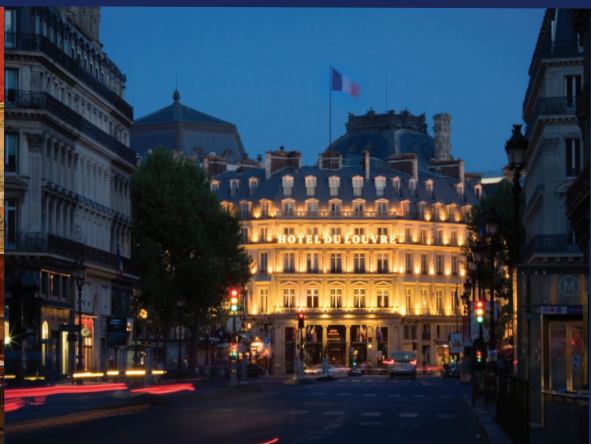
HÔTEL DU LOUVRE Paris, France

The ideal location of the historic Hôtel d'Argouges is perfect for exploring Normandy. This elegant, 18th-century residence owned by the same family for two generations invites you to experience luxury and comfort among refined surroundings: high ceilings, original doors, period fireplaces, and parquet floors polished by time.