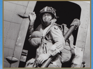
Paratrooper of the 101st Airborne Division prior to D-Day