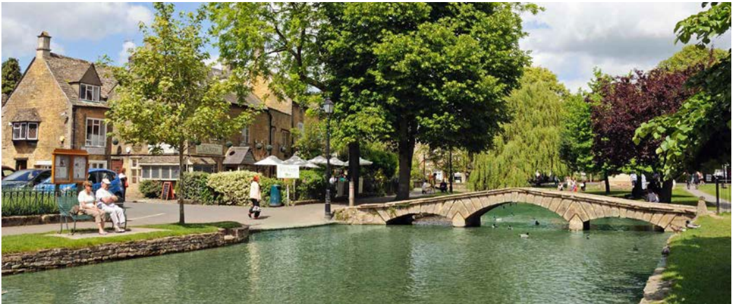
Bourton-on-the-Water along the Windrush River