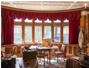
Bletchley Park Mansion