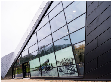
Battle of Britain Bunker