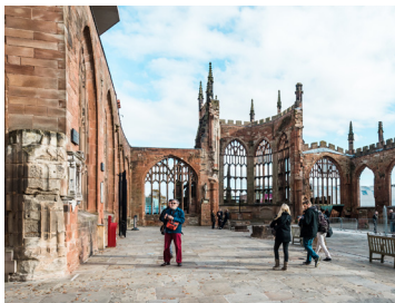
Cathedral Church of Saint Michael in Coventry