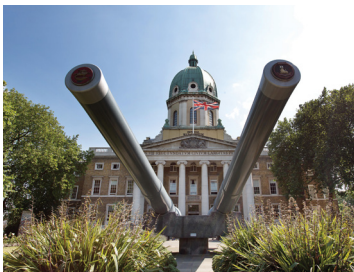
Imperial War Museum