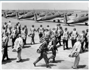
Trainee pilots rush to their aircraft prior to a flight.

Hear their stories. Learn their names. Stand where history was made.