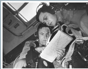
USAAF bombardier bomb aimers undergo training.