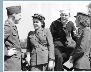
British women of the Auxiliary Territorial Service chat with US servicemen during World War II.