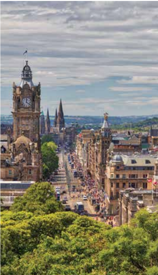
Edinburgh's grand and historic Princes Street

Day 12: Depart for U.S. We transfer this morning to the Edinburgh airport for our return flights to the U.S. B