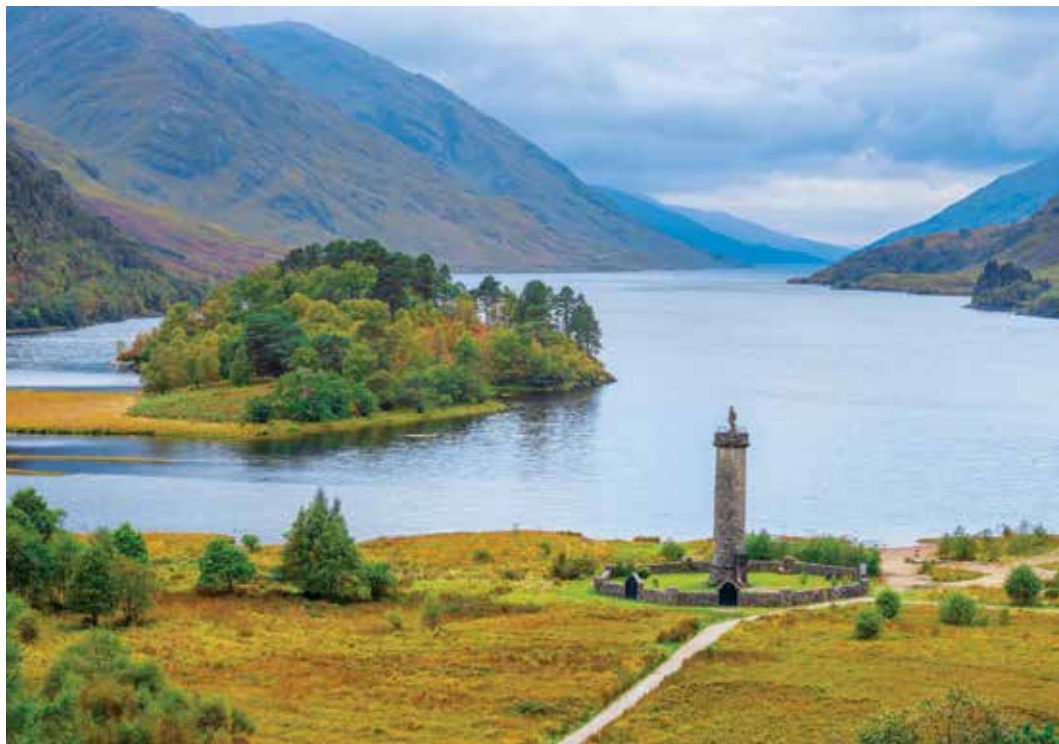
We'll visit the Glenfinnan Monument honoring "Bonnie Prince Charlie" on Day 5.

Day 5: Fort William/Isle of Skye We embark on a full-day excursion to the Isle of Skye, the largest of Scotland's Inner Hebrides, known for its vivid history, strong Gaelic influence, and stunning scenery. En route, we make a photo stop at Glenfinnan Monument, honoring "Bonnie Prince Charlie" for his leadership in the Jacobite Rising of 1745. Then we board a ferry for Armadale on the southern tip of the Isle of Skye. Our touring begins with a visit to Armadale Castle and Gardens, where we have lunch. Next we set out on a scenic drive through the imposing Cuillin Hills (or "Black Cuillin"). Returning to the mainland via the Skye Bridge, we stop to visit iconic Eilean Donan Castle then dine tonight at our hotel. B,L,D