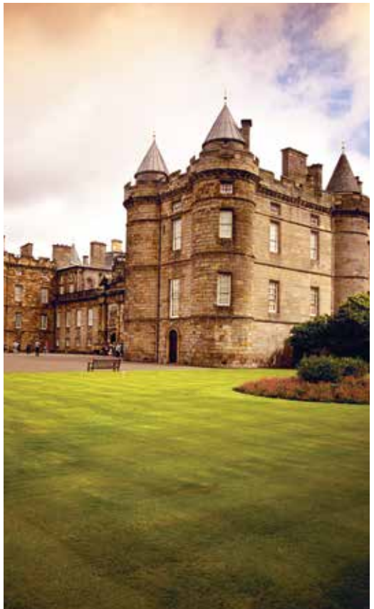
Scotland is home to more than 1,000 castles.