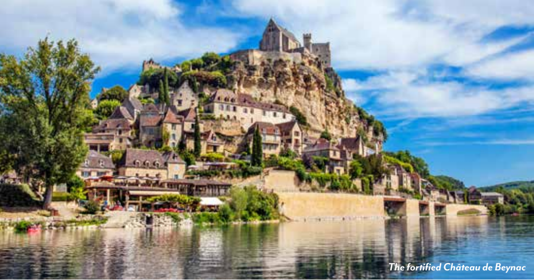
The fortified Château de Beynac