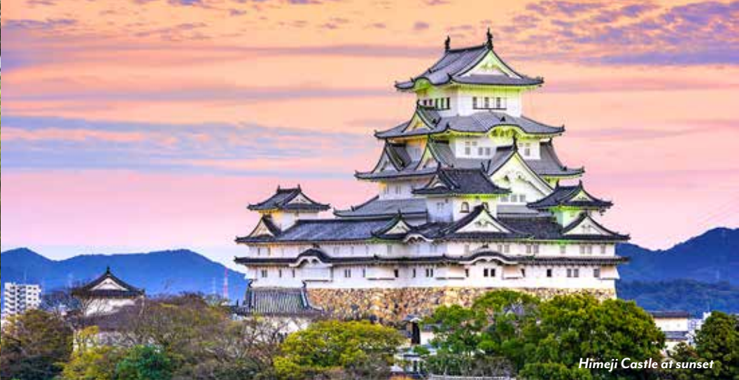
Himeji Castle at sunset