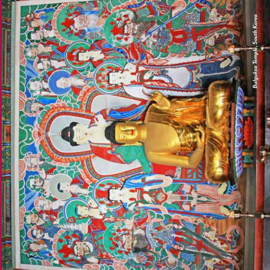
Bulguksa Temple, South Korea

Early Booking Savings* available | Save $2,000 per couple!