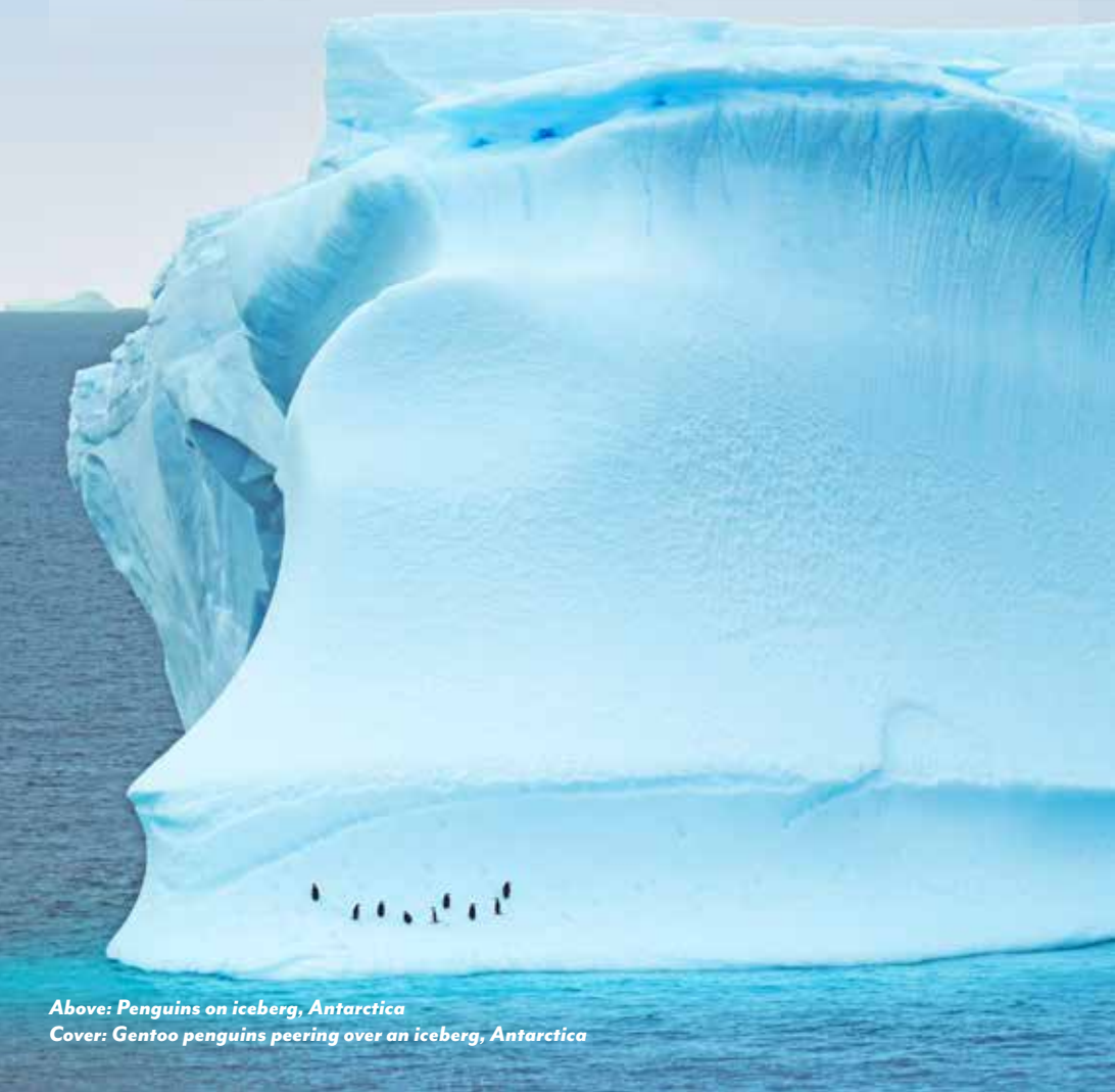
Above: Penguins on iceberg, Antarctica