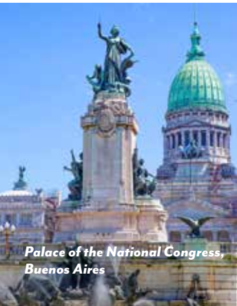
Palace of the National Congress, Buenos Aires

Deception Island | Half Moon Island Walk in the footsteps of great explorers on Deception Island, an extinct volcano in the South Shetland chain. Named