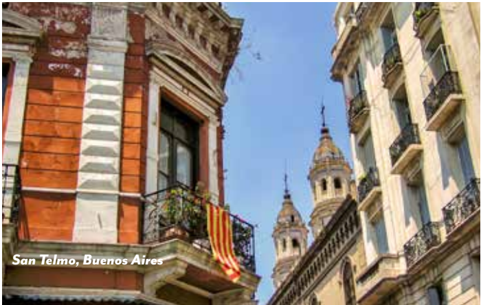
San Telmo, Buenos Aires