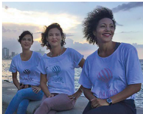
Founders and owners of Dador

Jewish Culture & Cuban Dance. Visit the Ashkenazi Community Center to learn about Cuba's Jewish culture. Then, stop at Malpaso, a contemporary dance studio to meet and