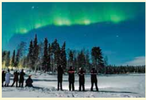
Northern Lights Village | Pyhä