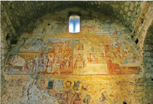
Ancient fresco paintings, Mystras

Enrichment: Classical Greece. Kalamata’s History & Cuisine. Stroll with your guide in Kalamata’s charming old town and learn about the city’s tumultuous past. As you listen to stories of Kalamata’s history and see points of interest, stop to taste traditional foods like their world-famous, fruity, sharp olives and fresh seafood. Try more specialties at lunch in the old town. Messene. This afternoon, take a guided tour of an under-the-radar gem, the splendid, vast ruins of Messene set in a serene mountain valley. Unlike other sites, this ancient city