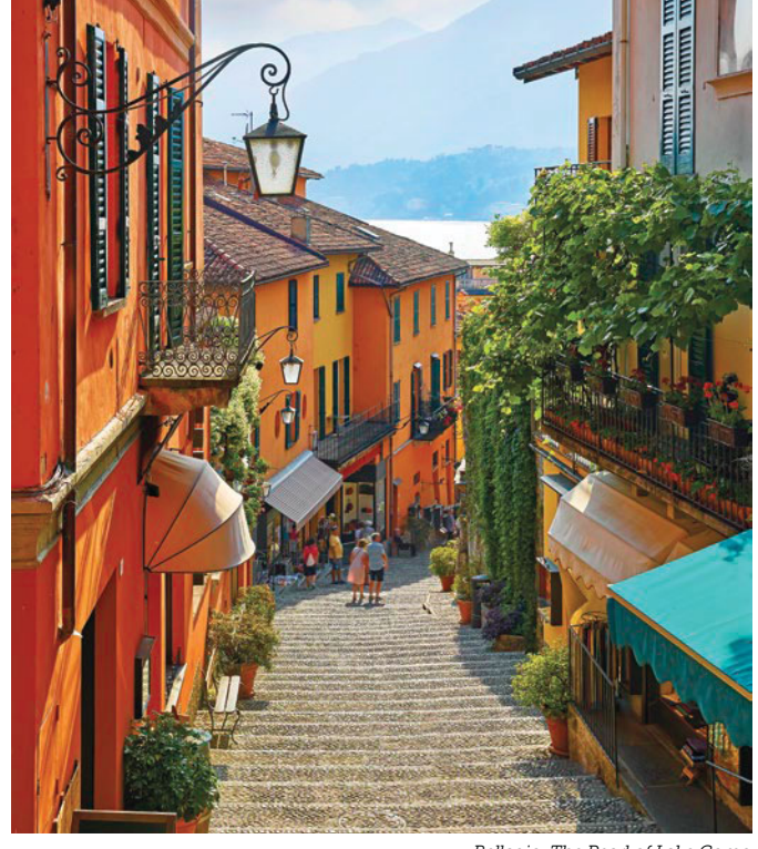
Bellagio, The Pearl of Lake Como