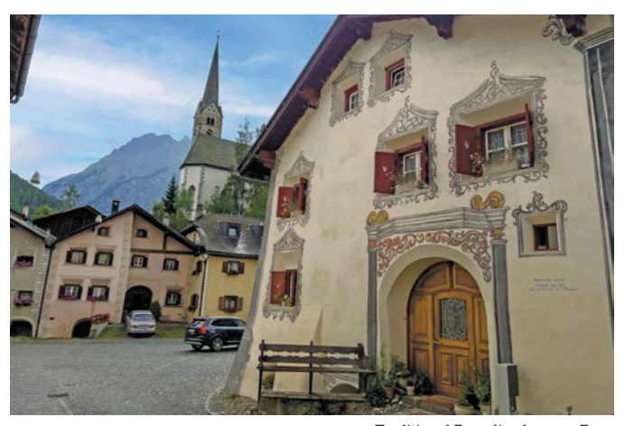
Traditional Engadine houses, Zuoz