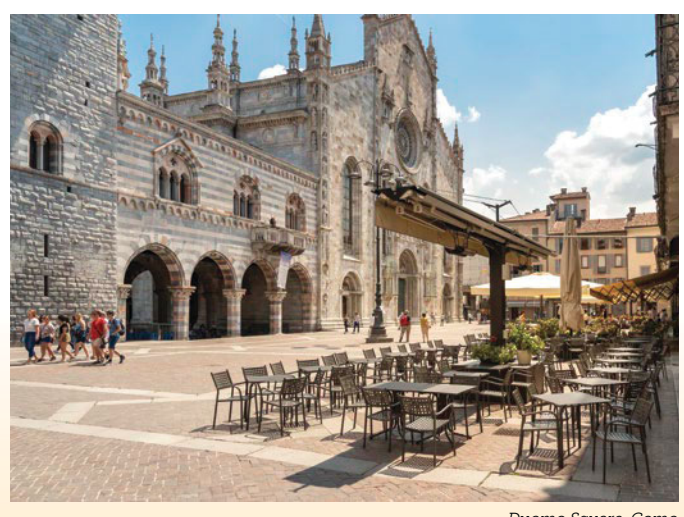
Duomo Square, Como