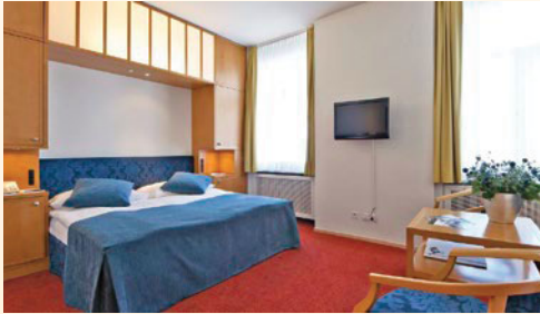
Hotel Schweizerhof | St. Moritz