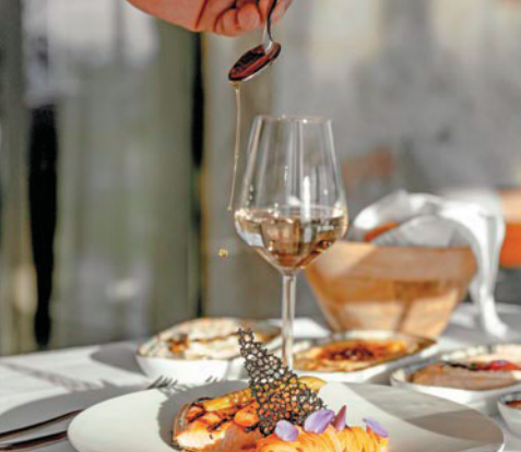
Book your journey today!