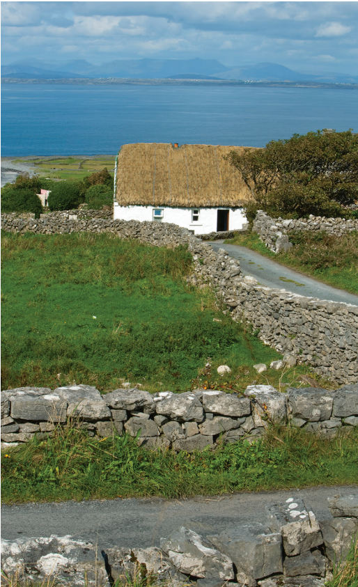
We spend Day 6 on the Aran Islands’ Inishmore.