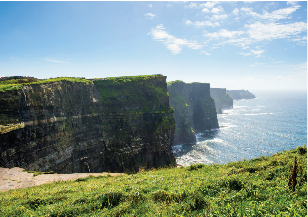
The sun shines down on the Cliffs of Moher, as we see on Day 7.

here, imparting local lore along the way. We stop at Dun Aenghus Fortress, the three prehistoric stone walls crowning the tallest cliffs of Inishmore; have lunch in a local pub; and enjoy some free time before returning to the mainland and our hotel late this afternoon. Dinner tonight is at a local restaurant in the village of Bearna. B,L,D