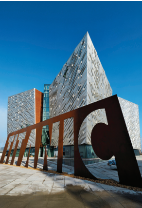
Titanic Museum, optional extension

Day 11: Kilkenny Today is devoted to Kilkenny, a well-preserved medieval city known as Ireland’s cultural capital – and the country’s smallest city. We tour 12 th -century Kilkenny Castle, considered one of the country’s most beautiful, then embark on an informal walking