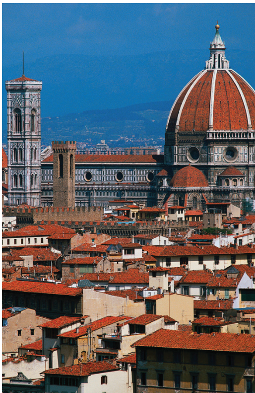
We visit splendid Florence on Day 12.

Day 16: Depart for U.S. We depart early this morning for our connecting flights to the U.S. B