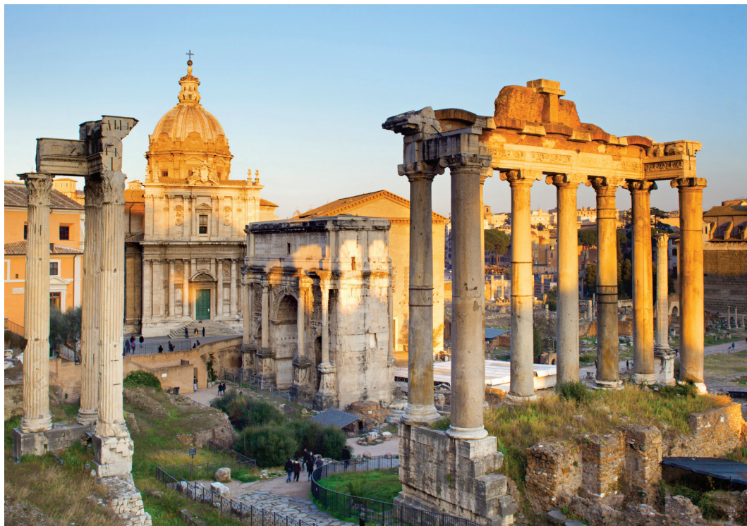
The Roman Forum dates to the 7 th century BCE.

Day 7: Rome Another morning of touring followed by a free afternoon. Today we visit the Vatican for a tour of St. Peter's Square and Basilica, and the Sistine Chapel in the Vatican Museums. Highlights include Michelangelo's Pieta in St. Peter's, considered one of the greatest sculptures of all time; his frescoed ceiling of the Sistine Chapel, now restored to its original glory; and art-filled St. Peter's itself, the most important church in all Christendom. B