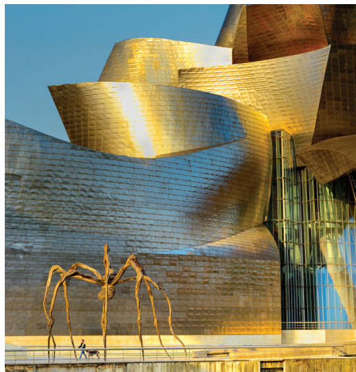
Bilbao's iconic Guggenheim Museum

Day 16: Barcelona Today we begin with a walk through Gaudí's fanciful Parc Guell. Then we take a paella cooking class to learn how to prepare one of Spain's most well-known dishes, and enjoy the fruits of our labors at a farewell lunch. This afternoon is at